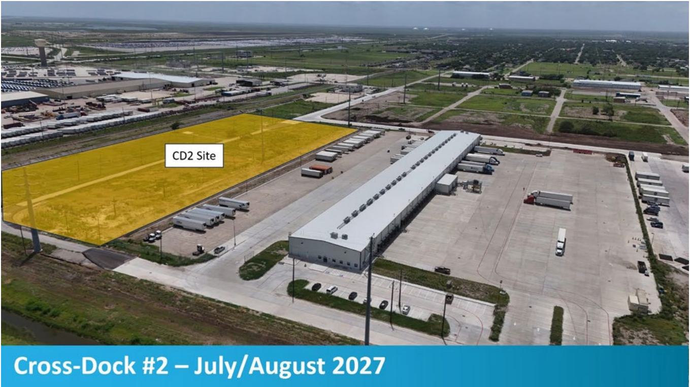
Diagram 2 – Diagram Location