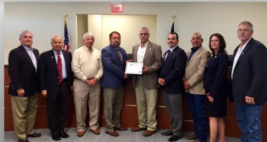
PHOTO CUTLINE: Port Freeport receives the America's Marine Highways Certificate of Project Designation.